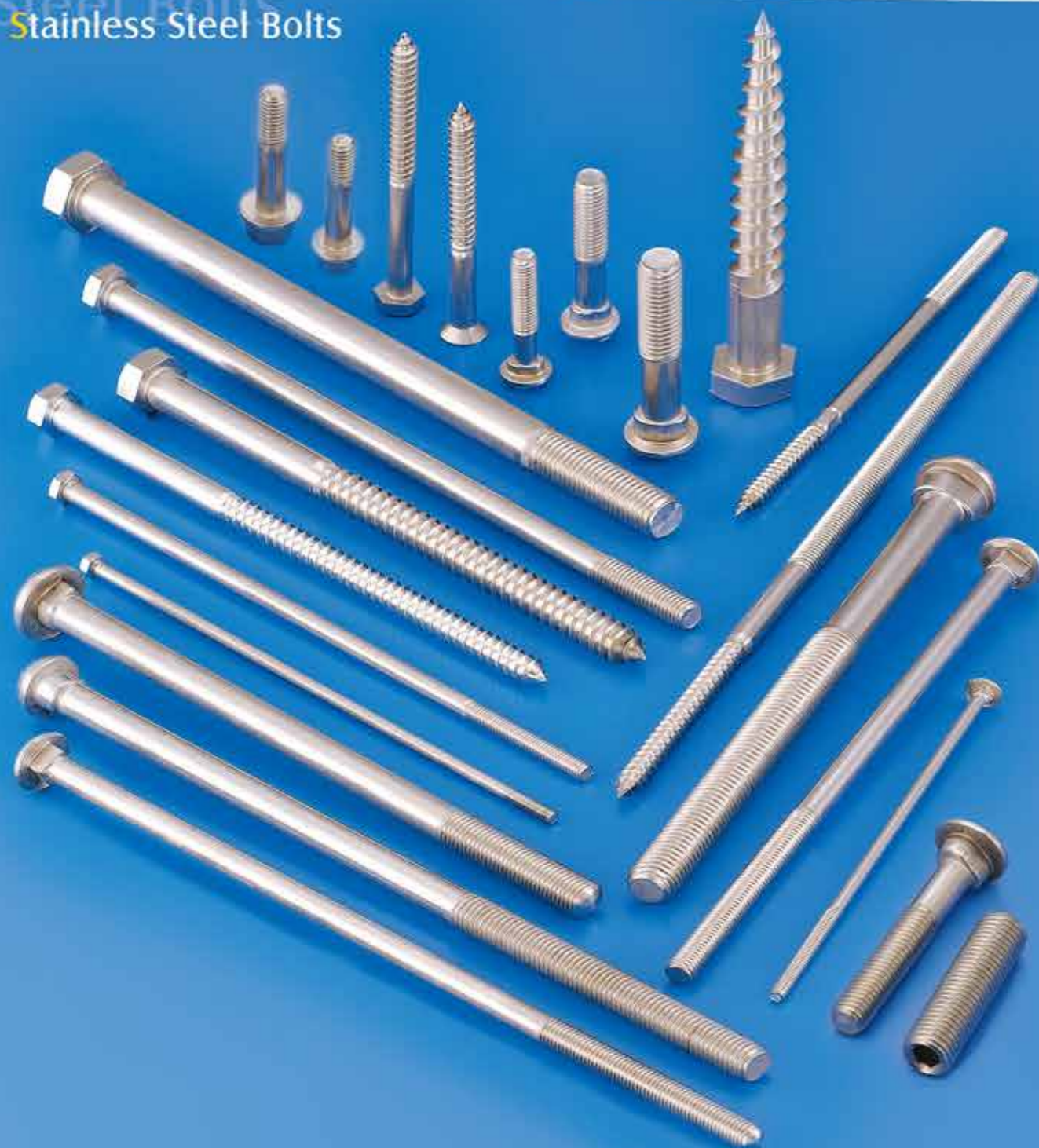
Stainless Steel Bolts