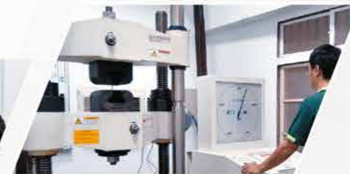
▲ Tensile Strength Machine