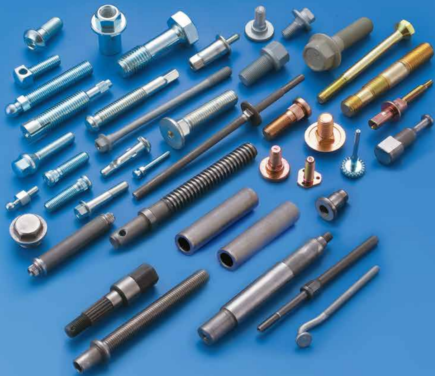
Custom Engineered Parts