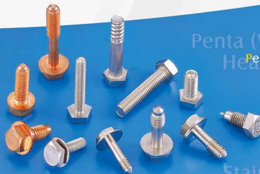
Stainless Steel Special Parts